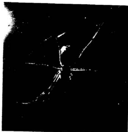
Linyphia sp. Indicator of grassland habitat