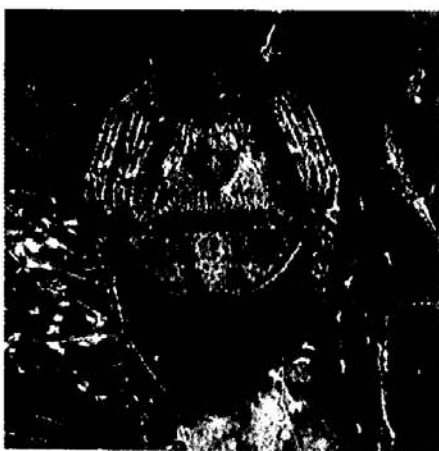
Cyrtophora unicolor Indicator of pure Sal woodland habitat