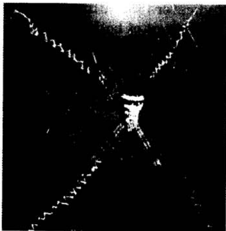
Argiope pulchella Indicator of riparian swamp habitat

Indicator Species of spiders in different habitats in Tarai Conservation Area