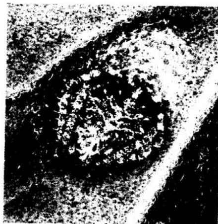
Neoscona vigilans Indicator of mixed Sal woodland habitat