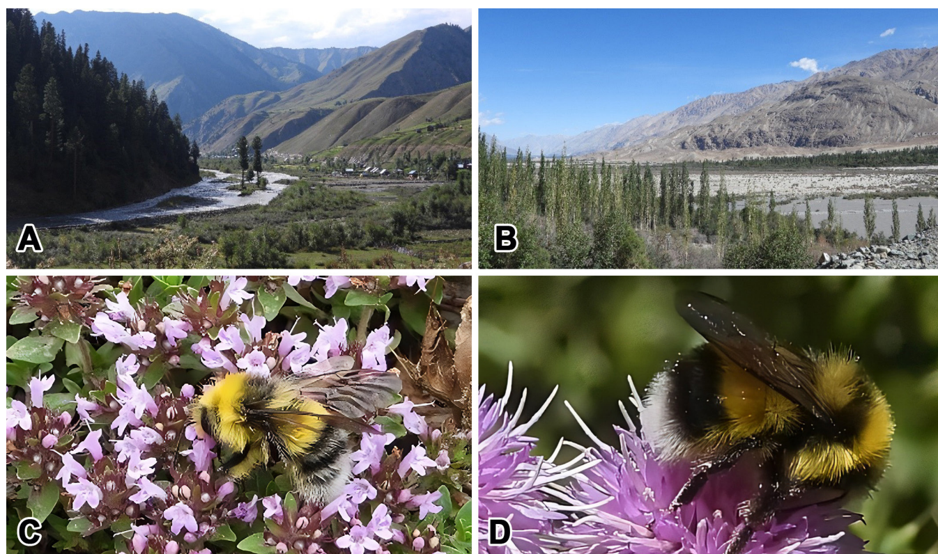
Figure 2. Collection Sites. A. Gurez Valley, 2678 m AMSL; B. Panamik, 3256 m AMSL; C. Bombus cryptarum on Thymus linearis Benth (Himalayan thyme); D. Bombus cryptarum (Fabricius, 1775) on Cirsium arvense (L.) Scop. (Creeping thistle).