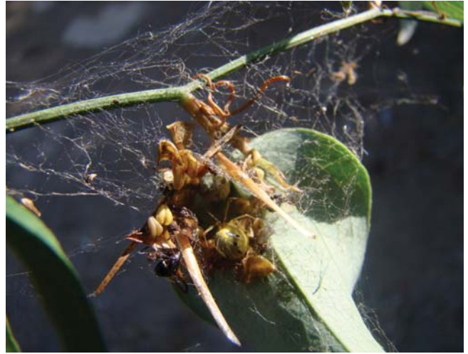
Fig 2. Female of Phylloneta impressa with egg sac in Smilex aspera plant (Climber)