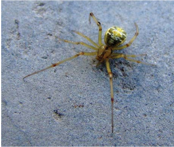
Fig 1. Mature female of Phylloneta impressa L.Koch, 1881