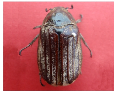
Melolontha cuprescens Blanchard