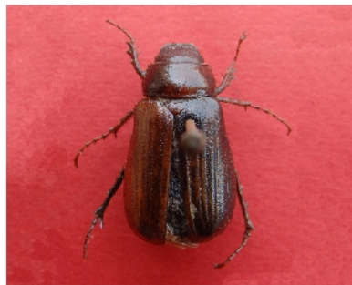
Holotrichia longipennis Blanchard