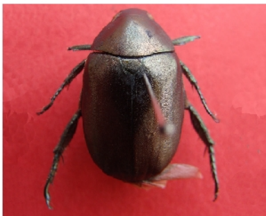
Anomala cantori (Hope)