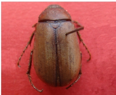
Hilyotrogus holosericeus Redtenbacher