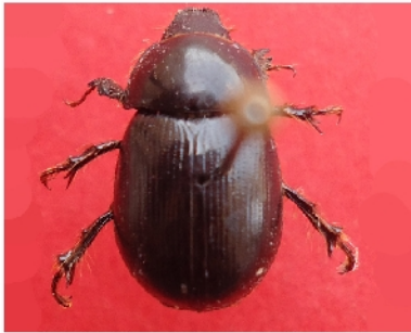
Hybosorus orientalis Westwood